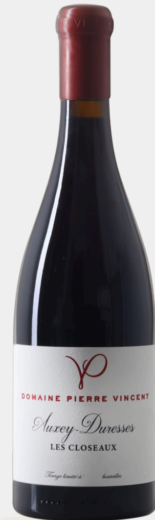
Auxe-Duresses Les Closeaux - 2024

“There is quite a noticeable fish scale scent on the dark berry fruit that I quite like. Very fresh. The palate is medium-bodied with crunchy dark berry fruit, sorbet-fresh with a tang of blood orange on the short finish.”