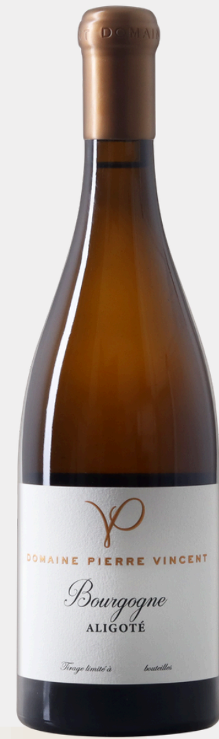
Bourgogne Aligoté - 2024

“This has quite an introspective nose that demands coaxing from the glass, with hints of dried honey and lanolin. The palate is quite tangy on the entry with a keen thread of acidity, sorbet fresh with a hint of pepperiness on the finish where this Aligoté really comes to life.”