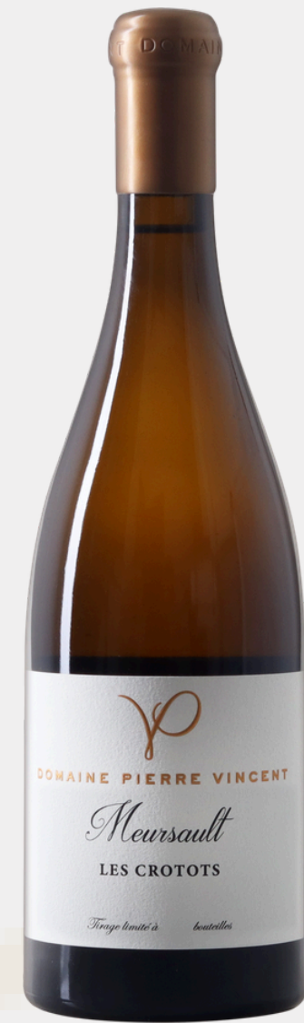
Meursault Les Crotots - 2024

“The 2024 Meursault Les Crotots has a complex bouquet, quite mineral driven with just the faintest reduction, scents of walnut and hazelnut surface with aeration, all very well defined. The palate is fresh and vibrant, with a keen line of acidity and beautifully.”